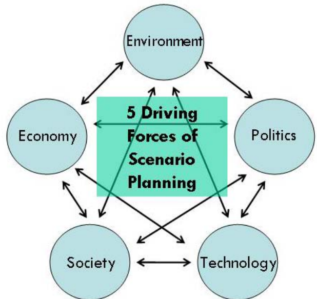
Diagram 11: A Systems Approach

The outcomes of the scenario planning process can be used to help practitioners and stakeholders draw out a common vision. Scenario planning can be utilized in different forms, along different timescales, with different types of participant groups. It can be a very involved and lengthy process, inclusive of public participation and broad stakeholder input. Alternately, it could be a one- to two-day workshop, specifically for leadership and key stakeholders.