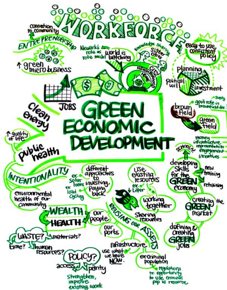
Diagram 10: What Does Green Economic Development Mean for Newark, NJ?